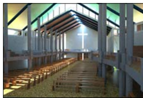
TAV. A7 Elevations scale 1:100 - June 2012